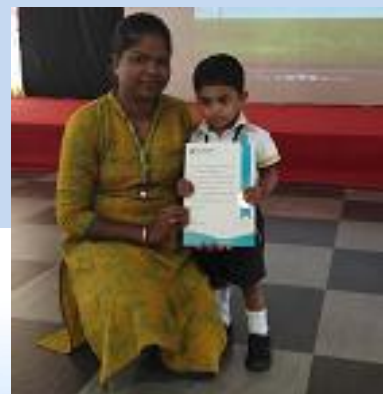
Thank you for the certificates ma'am