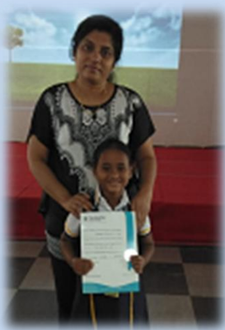
Happy to receive a certificate