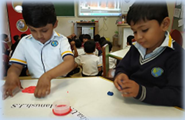
Let me do a smiley using clay