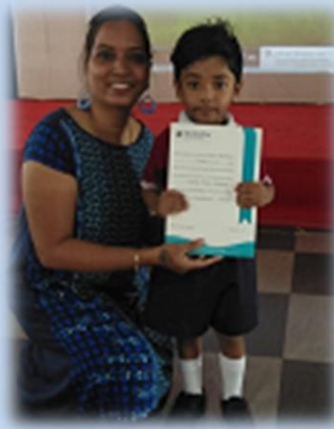
Happy to receive the certificates