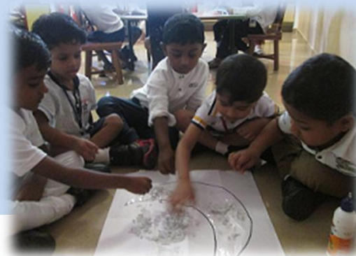
Here is our shiny glittery moon