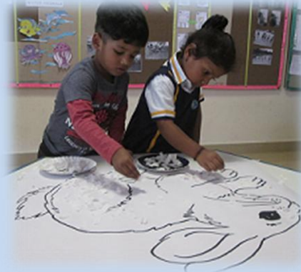
Decorating the rabbit using tissue paper