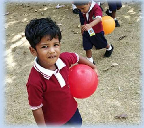
Our happiness in playing with balloons