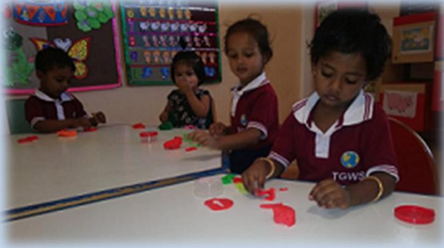
We are busy with the clay

Clay molding helps to develop visualization and interpretative skills. It also allows children avenue for self – expression. It helps to develop hand-eye coordination and fine motor skills. Clay gives them the opportunity to be creative and learn more about texture, shape and form. Children made car, small balls , tiny flowers and dolphins.