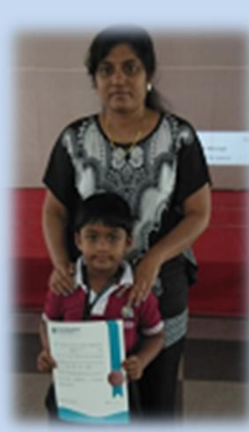
Happy to hold the big certificate