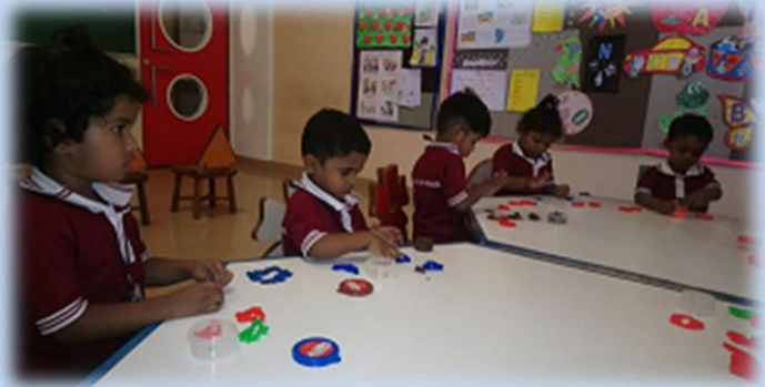
We learned to make many animals