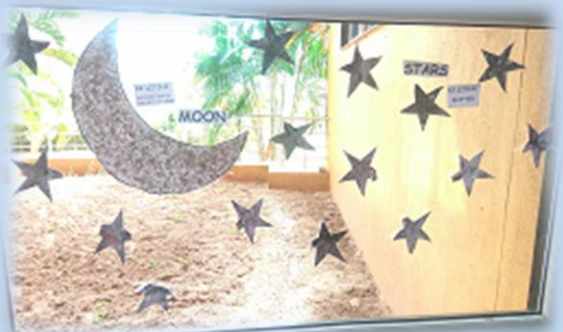
White world is glittering