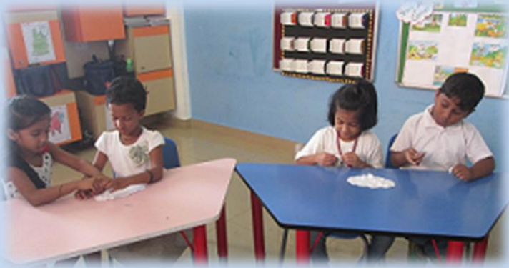
A white cloud!!!