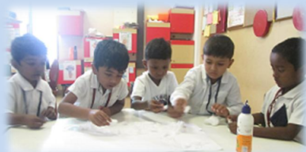
Swan looks so beautiful