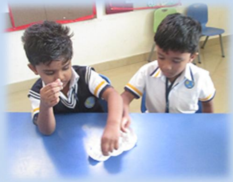
We made it using cotton.