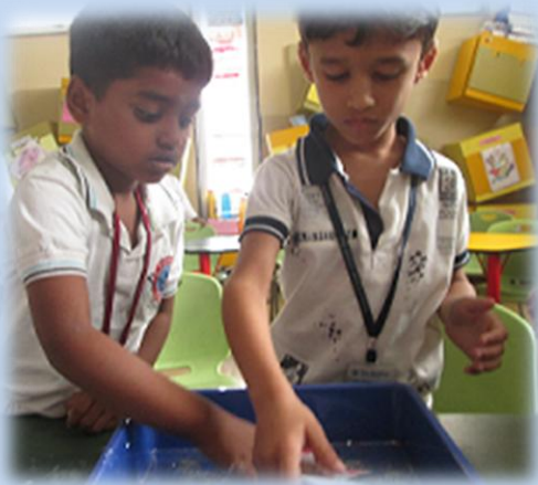
Our stars are decorating the star with glitters