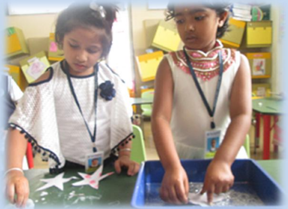
Ours kids are happy to make a glitter star