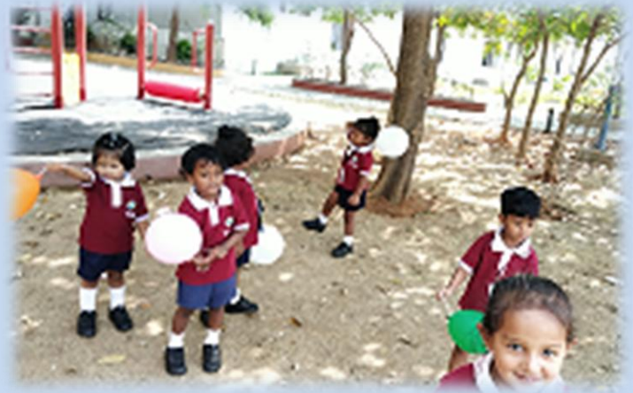
We played throw and catch with colourful balloons