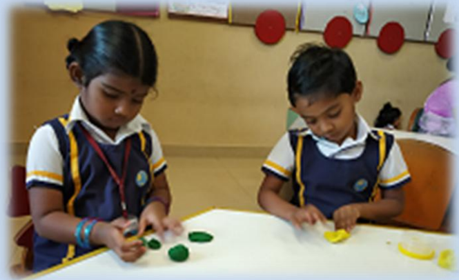
Lets go for a drive in a car